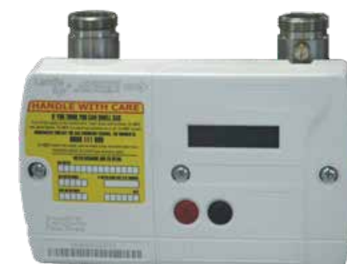
Landis+Gyr Libra310 Gas Meter