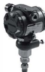
Rosemount 2088 A pressure transmitter

The 2088 A and 3051 CA pressure transmitters have been approved for custody transfer metering and can also be used in conjunction with other RMG gas volume correctors.