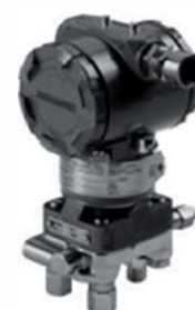
Rosemount 3051 CA pressure transmitter