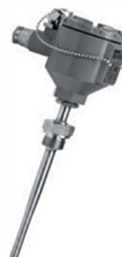
PT 100 Ex (d) resistance thermometer

The PT 100 resistance thermometer has been approved for custody transfer metering. It can be used either directly in the fluid or in a sensor pocket. The PT 100 resistance thermometer can also be used in conjunction with other RMG gas volume correctors.